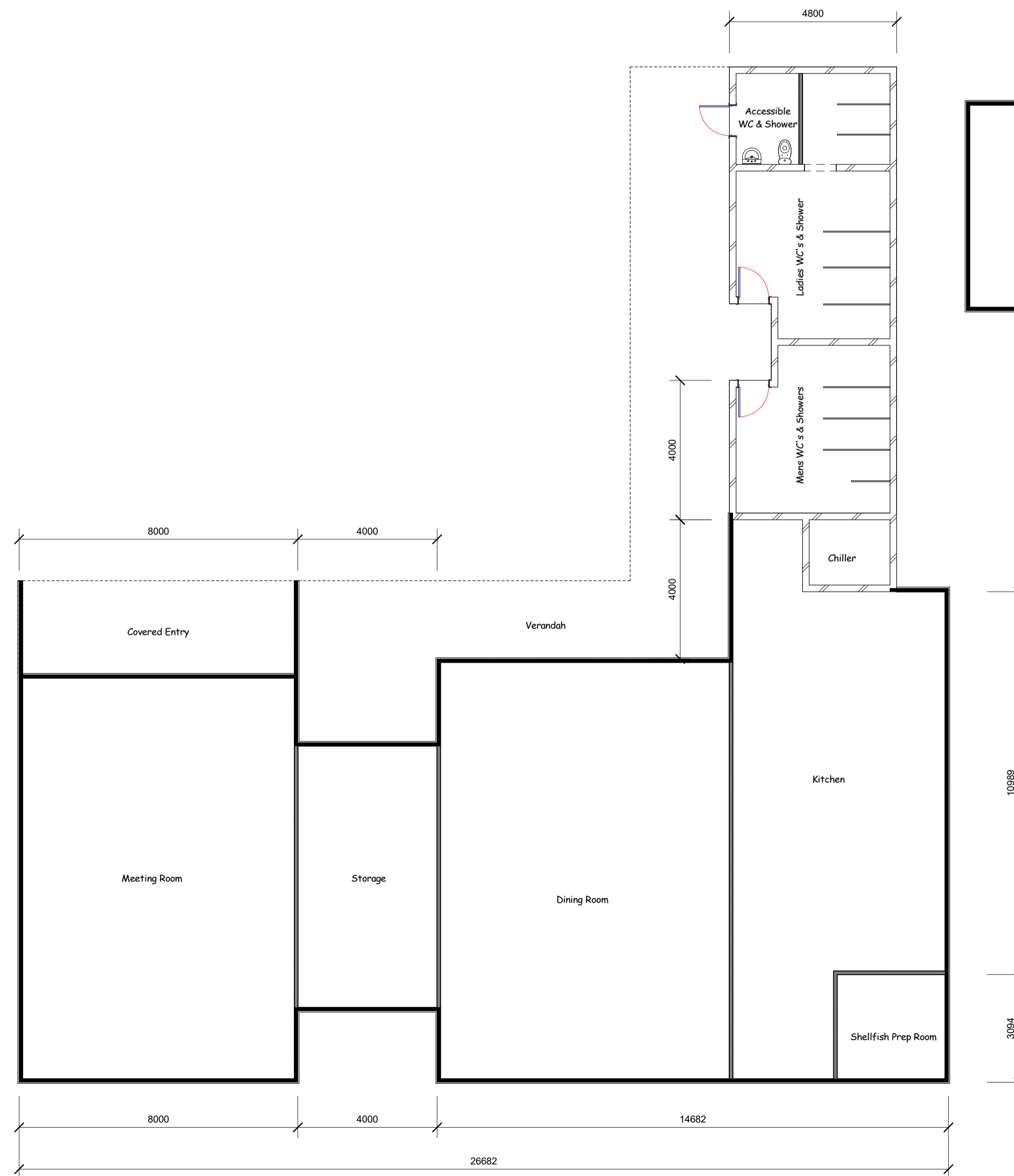
1 200 Existing Floor Plan 1 : 100

Written Dimensions take precedent over scaled dimensions The Contractor shall check and verify all dimensions on site. Any discrepancy shall be referred to the designer for clarification.